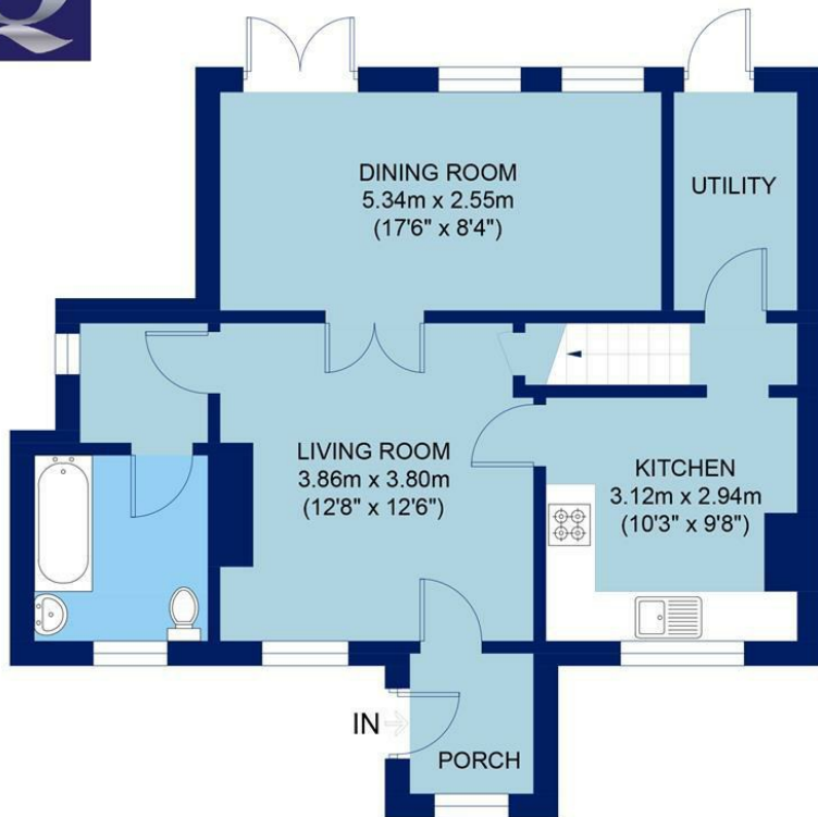
GROUND FLOOR GROSS INTERNAL FLOOR AREA 584 SQ FT